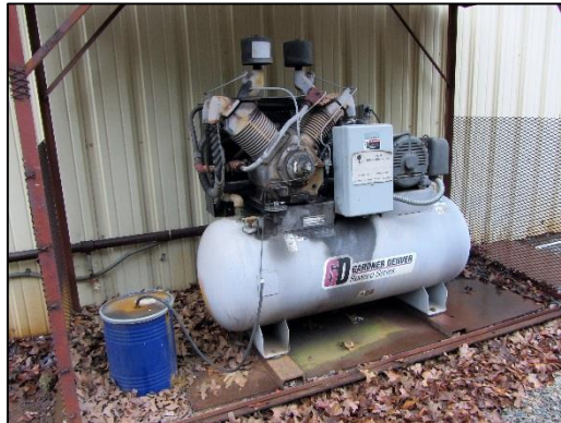
GARDNER DENVER 25HP RECIPROCATING AIR COMPRESSOR