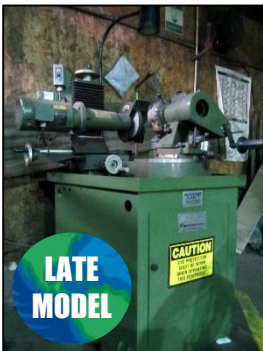
RUSH 250A UNIVERSAL TOOL & CUTTER