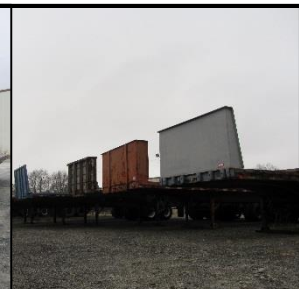
(15+) ASSORTED TRAILERS