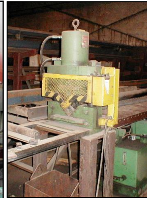
FRANKLIN ANGLE SHEAR

Want to Sell Your Shop or Know Someone Who Does? Call Us Toll Free at (888) 800-4442! We Pay Great Finder's Fees!