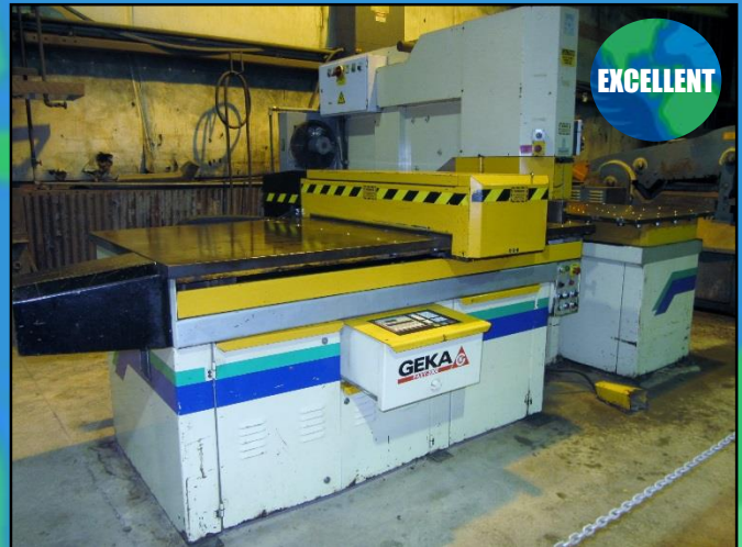
GEKA PUMA 220/PD CNC HYDRAULIC PUNCH

Inspection: MONDAY, APRIL 9 TH FROM 8:00 A.M. - 4:00 P.M. EDT