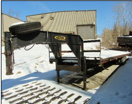
QUALITY TRAILER INC. 38' GOOSENECK FLATBED TRAILER