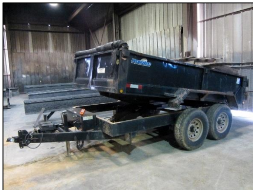
TOW-RITE HAWKE DUAL AXLE HYDRAULIC DUMP TRAILER