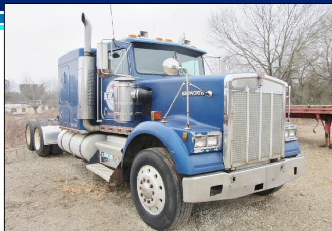
KENWORTH DIESEL TRACTOR TRUCK WITH SLEEPER