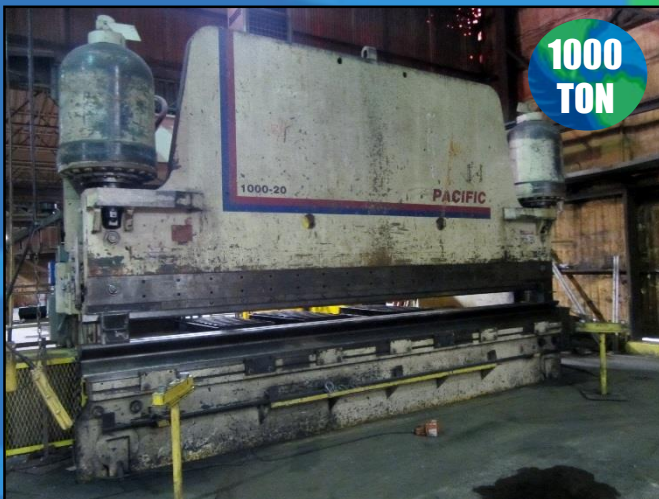
PACIFIC 1000-20 20' X 1000 TON HYDRAULIC PRESS BRAKE