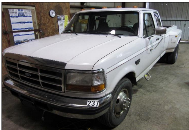
FORD F350 XLT DUALLY PICK-UP TRUCK