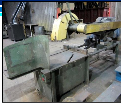
WALLACE 600 TRAVELING ABRASIVE CHOP SAW