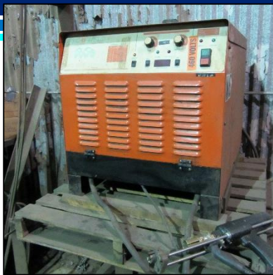
PRO-WELD ARC1850 STUD WELDER