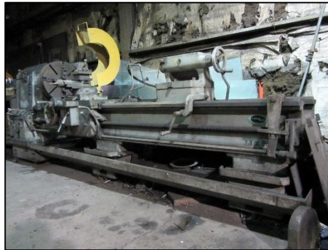
CINCINNATI 26" x 98" CC TRAY TOP ENGINE LATHE