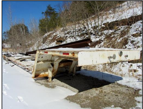
50' SINGLE DROP HEAVY DUTY TRANSPORT TRAILER