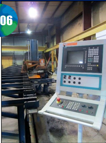
PEDDINGHAUS 1000B OCEAN AVENGER CNC BEAM DRILL