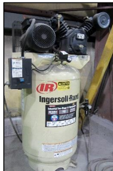
INGERSOLL RAND 7.5HP RECIPROCATING AIR COMPRESSOR