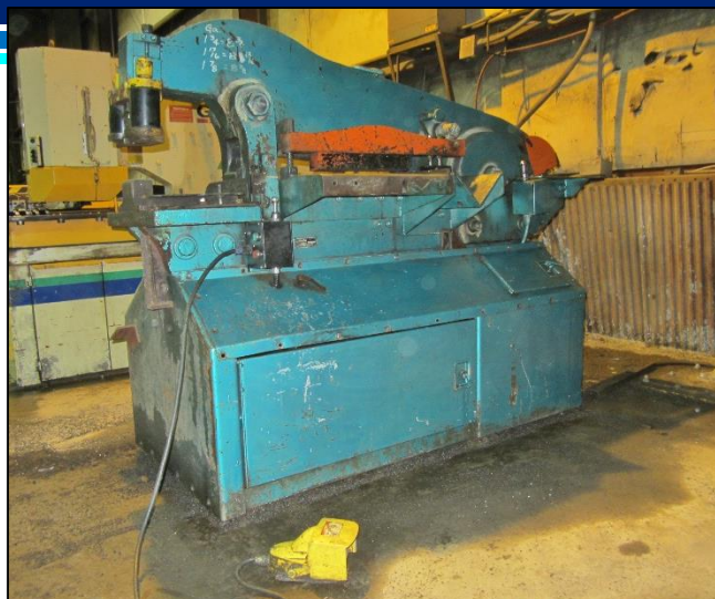
PIRANHA P4 90 TON HYDRAULIC IRONWORKER