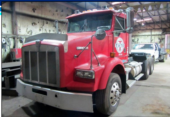
KENWORTH DIESEL TRACTOR TRUCK