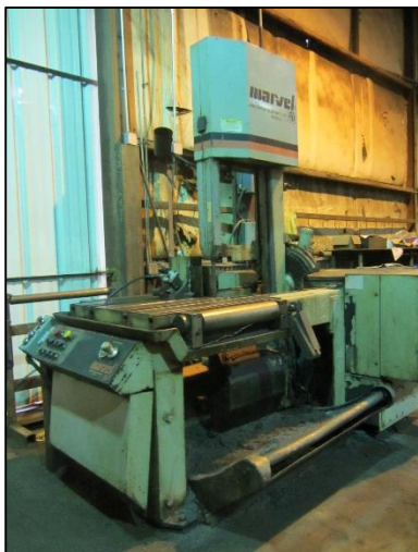
MARVEL SERIES 81/11 AUTO TILT-FRAME VERTICAL BANDSAW

SOCO 12" Mitre Cutting Cold Saw with Double Acting Vise, Mitres, Barstop, sn:2752636, mfg.2000