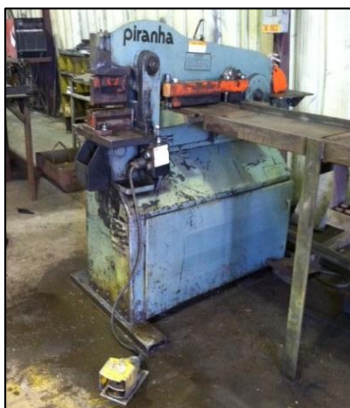
PIRANHA P3 HYDRAULIC IRONWORKER