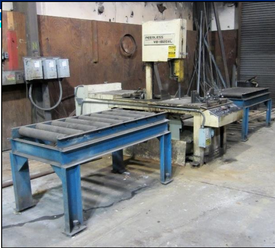
PEERLESS VB-1820XL TILT FRAME VERTICAL BANDSAW