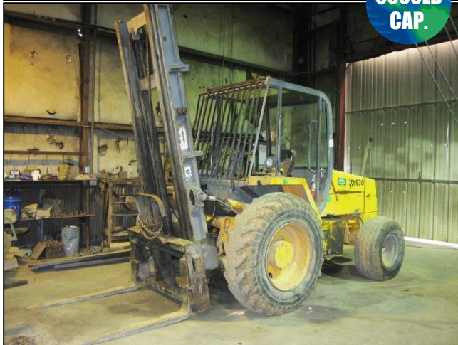
(3) JCB 930 6000LB ROUGH TERRAIN FORKLIFTS