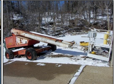
SNORKELIFT 42 SNORKEL MANLIFT