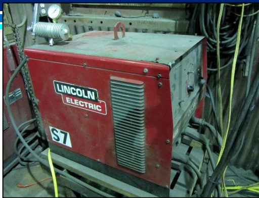
LINCOLN SQUARE WAVE TIG 355 TIG WELDER