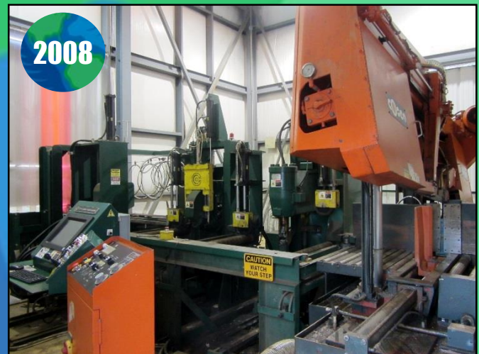
CONTROLLED AUTOMATION BLW-RETRO BEAM PUNCH