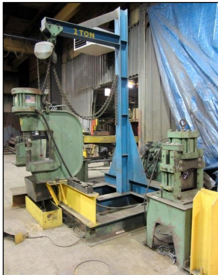
PEDDINGHAUS 100 TON HYDRAULIC PUNCH & ANGLE SHEAR

8' x 1/4" (Approx.) PYRAMID Plate Bending Roll with Manual Drop End, Adjustable Top Roll, Pendant Control & Skid Mounted