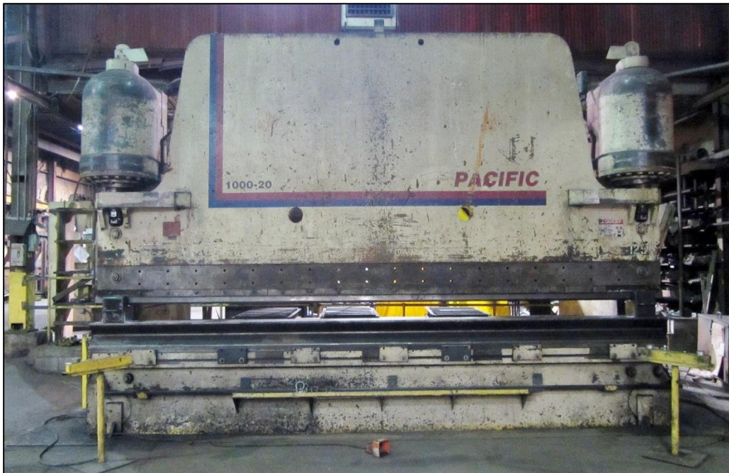
PACIFIC 1000-20 20' X 1000 TON HYDRAULIC PRESS BRAKE

INSPECTION: MONDAY, APRIL 7 TH FROM 8:00 A.M. – 4:00 P.M. EST