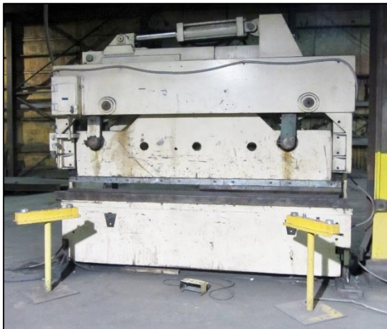
< HTC 10' X 100 TON HYDRAULIC PRESS BRAKE

AMERICAN HERCULES 10' x 3/8" Hydraulic Plate Shear with (9) Hydraulic Hold Downs, Finger Guard, sn:537512044