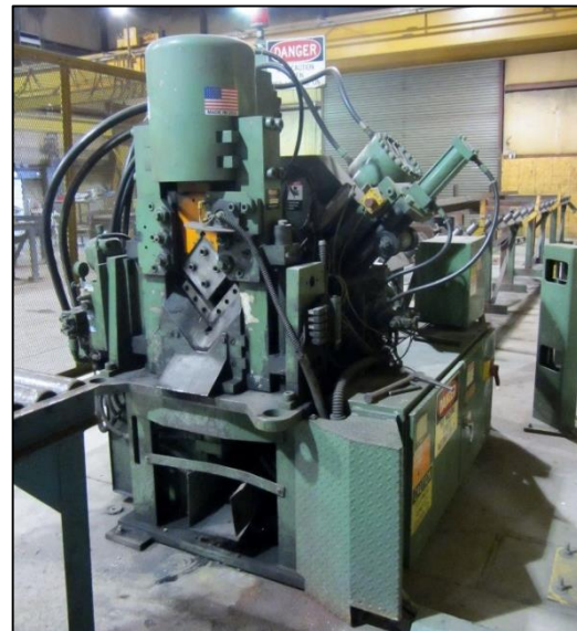
> PEDDINGHAUS AFCPS-623L CNC ANGLEMASTER