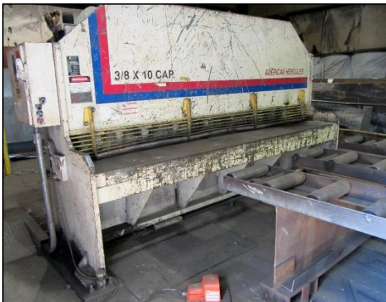
< AMERICAN HERCULES 10' X 3/8" HYDRAULIC PLATE SHEAR