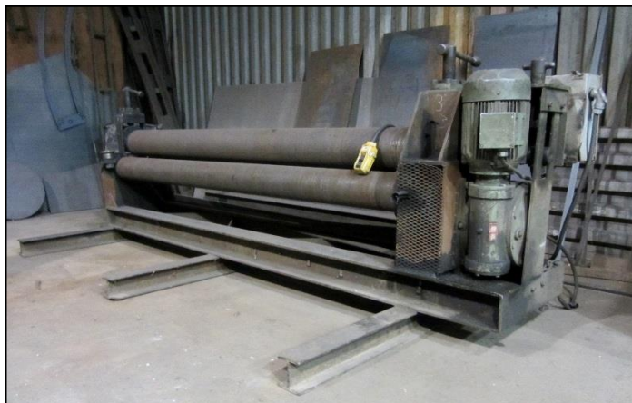
< 8' x 1/4" PYRAMID PLATE BENDING ROLL