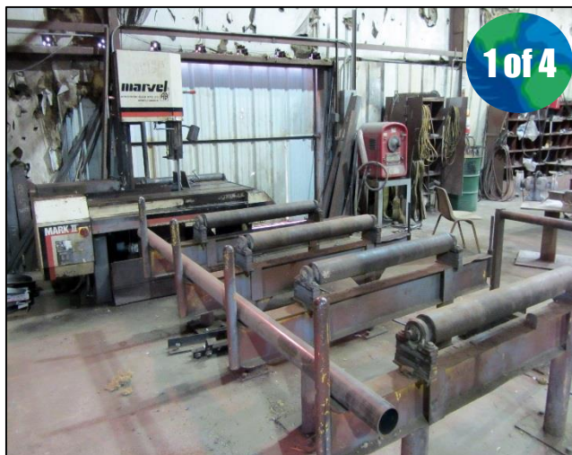
MARVEL SERIES 8 MARK II TILT FRAME VERTICAL BANDSAW