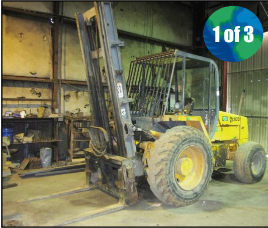
1 OF 3 JCB 930 6000LB ROUGH TERRAIN FORKLIFTS

Asset Sales, Inc. SC License # 003427F – Lance Mannion SC License # 3113R