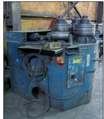
ROUND R-4 3-1/2" X 3-1/2" X 3/8" ANGLE BENDING ROLL