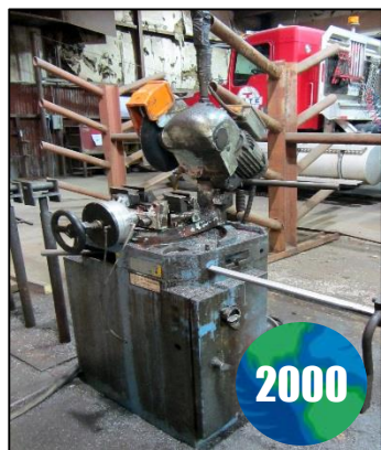
SOCO 12" MITRE CUTTING COLD SAW