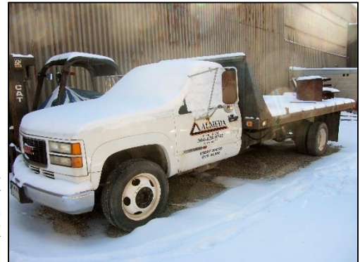
> GMC 3500 HEAVY DUTY FLAT BED TRUCK