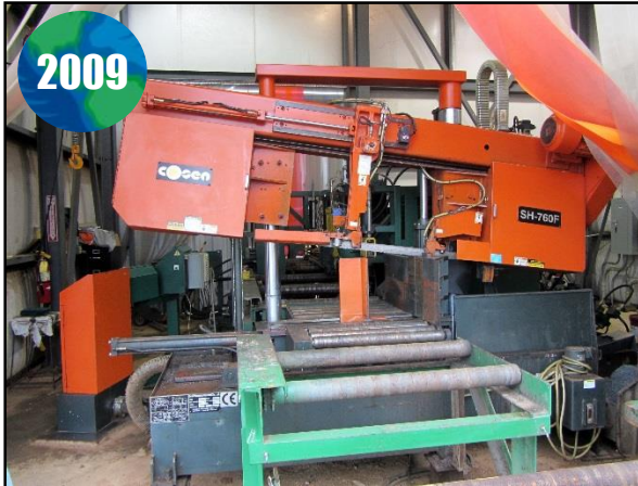
COSEN SH-760F HORIZONTAL STRUCTURAL STEEL BANDSAW

HONDA GX160 5.5 Portable Job Air Compressor