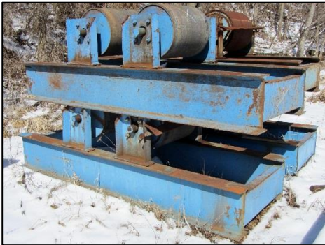
6 SETS OF TANK TURNING ROLLS