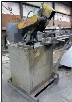
EVERETT 16MIT ABRASIVE CHOP SAW