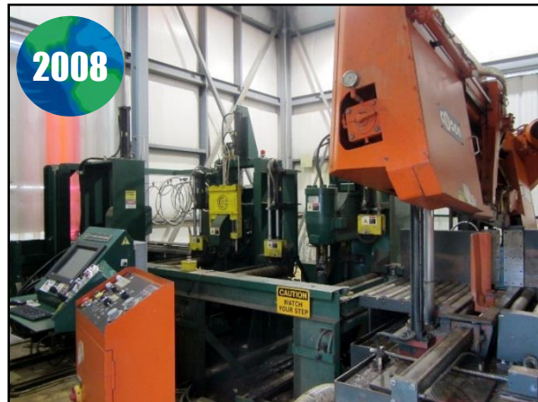
CONTROLLED AUTOMATION BLW-RETRO BEAM PUNCH

Want to Sell Your Shop or Know Someone Who Does? Call Us Toll Free at (888) 800-4442! We Pay Great Finder's Fees!