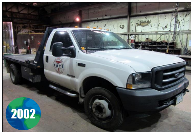
FORD F550 XL SUPER DUTY FLAT BED WORK TRUCK