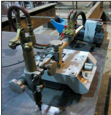
VICTOR VCM200 TRACK TORCH BURNING MACHINE