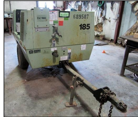
HONDA GX160 PORTABLE JOB AIR COMPRESSOR