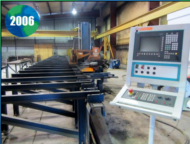
PEDDINGHAUS 100B OCEAN AVENGER CNC BEAM DRILL

Inspection: MONDAY, APRIL 7 TH FROM 8:00 A.M. - 4:00 P.M. EDT