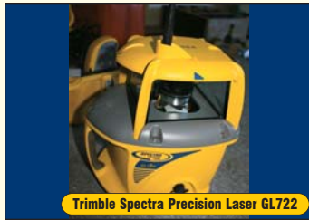
Trimble Spectra Precision Laser GL722

Acklands 230/460/575 Volt AC DC Arc Welder, Mounted on Steel Frame w/ Whls. s/n JJ372476.