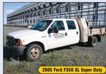
2005 Ford F350 XL Super Duty