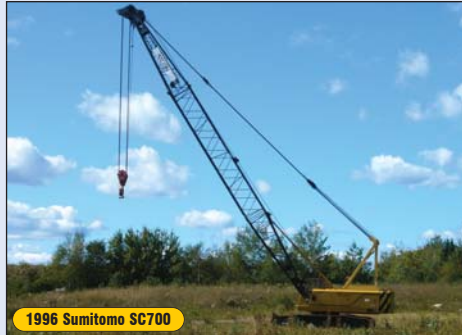
1996 Sumitomo SC700