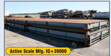
Active Scale Mfg. IQ+39000

An "Equipment by Location" listing, along with a location by location viewing schedule will be available prior to the viewing dates.