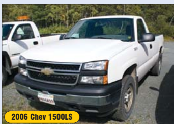
2006 Chev 1500LS