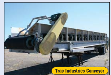
Trac Industries Conveyor

1980 Temisko 8640 , 26', S/A w/ Samsung 600 Volt, 3-Phase Gen Set (s/n 8056-1) p/w Detroit V12 Eng., (disassembled, for parts).