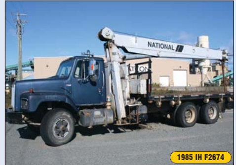
1985 IH F2674