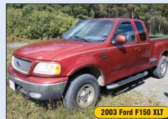
2003 Ford F150 XLT