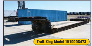
Trail-King Model 1K100DG473