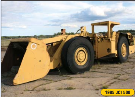
1985 JCI 500