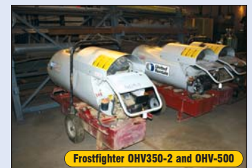
Frostfighter OHV350-2 and OHV-500