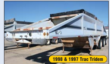
1998 & 1997 Trac Tridem