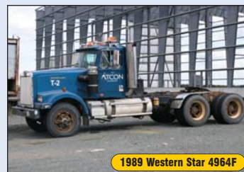
1989 Western Star 4964F