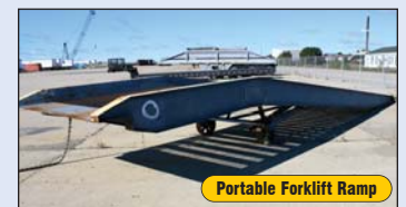
Portable Forklift Ramp