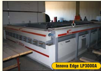
Innova Edge LP3000A