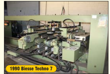
1990 Biesse Techno 7

Rexroth Portable Hyd. Power Pack w/ 5 HP Baldor Motor, Hyd. Press w/ Adj Table, Misc. Steel Stands and Roller Stands, Steel Frame Shelving unit w/ Large Qty. of Misc. Scrap Iron, Shafting, etc., Qty. of Plate Steel Pcs., Misc. Oxyacetylene Gauges, Hoses, etc., Trash Pump Mounted on S/A Carrier w/ 9 HP. Honda Eng., Honda 5-1/2 HP. 2" Trash Pump, Honda 3" Water Pump, Misc. Slings, Steel Steps, Brooms, Shovels, Steel Stands, etc., HD Steel Welding Table, 1" Plate Top, Misc. Ext. Cord, Vac Cleaner, Steel Rack, Hyd. Power Pack w/ Baldor Elec. Dr., Misc. Pneumatic Clamps, Qty. of Misc. Moulder Blades, Pullies, etc.