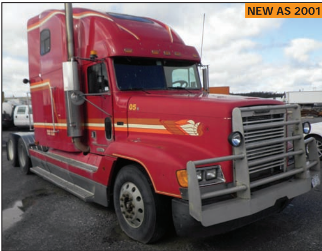
FREIGHTLINER FLD120 tandem axle tractor