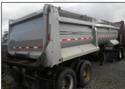
MIDLAND SK2400 tandem axle end dump trailer