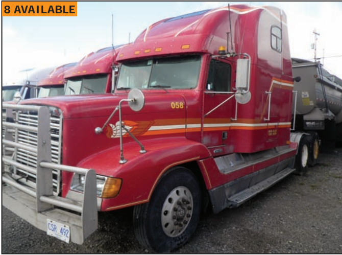
FREIGHTLINER FLD120 tandem axle tractor