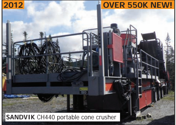
SANDVIK CH440 portable cone crusher