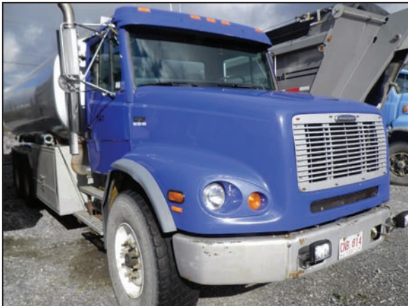
STERLING L9500 tri-axle conventional tractor