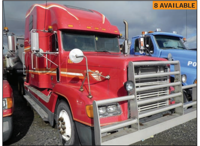
FREIGHTLINER FLD120 tandem axle tractor