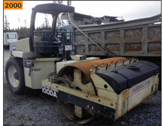
INGERSOLL-RAND SD100A PRO PAC asphalt compactor