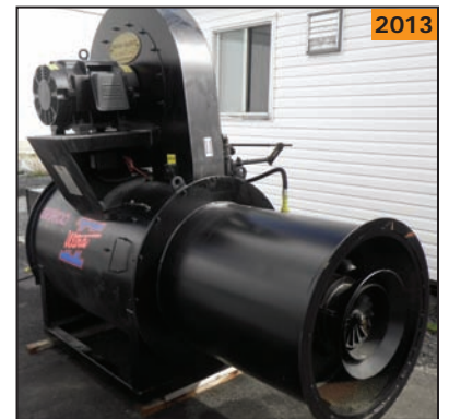
GENCOR NEW ULTRA II 85 oil fired burner