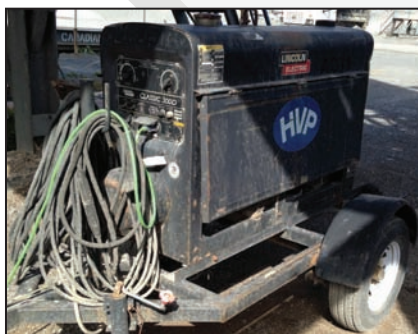
LINCOLN CLASSIC 300D generator welder w/ trailer