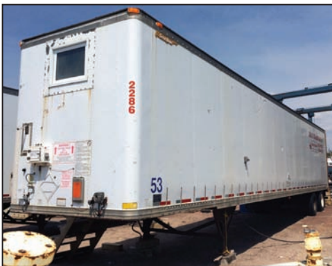
GREAT DANE 53' tandem axle van trailer