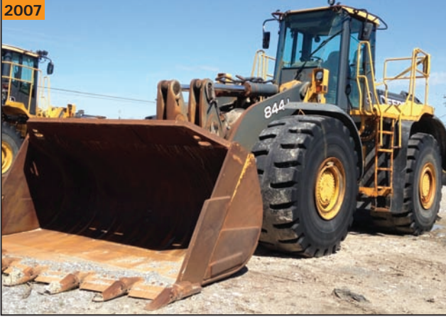
JOHN DEERE 844J articulated wheel loader