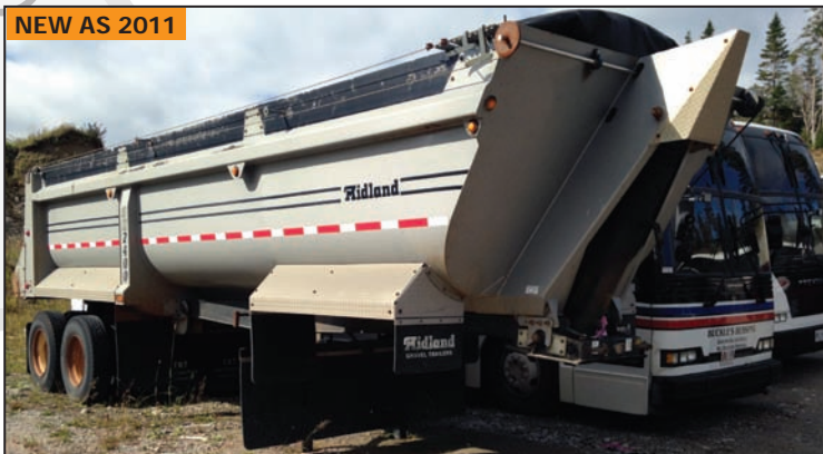
MIDLAND SK2400 tandem axle end dump trailer