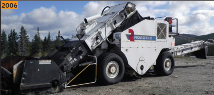
ROADTEC SB-2500C shuttle buggy