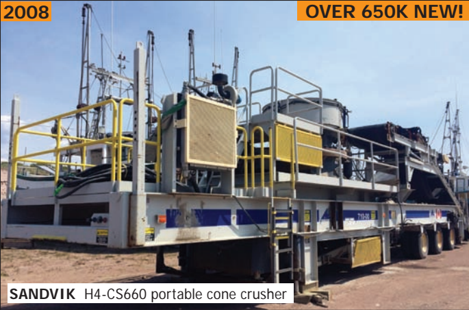
SANDVIK H4-CS660 portable cone crusher