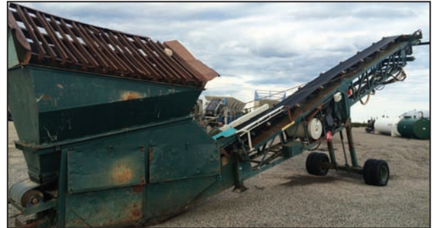
POWERSCREEN M65 stacking conveyor with feed hopper