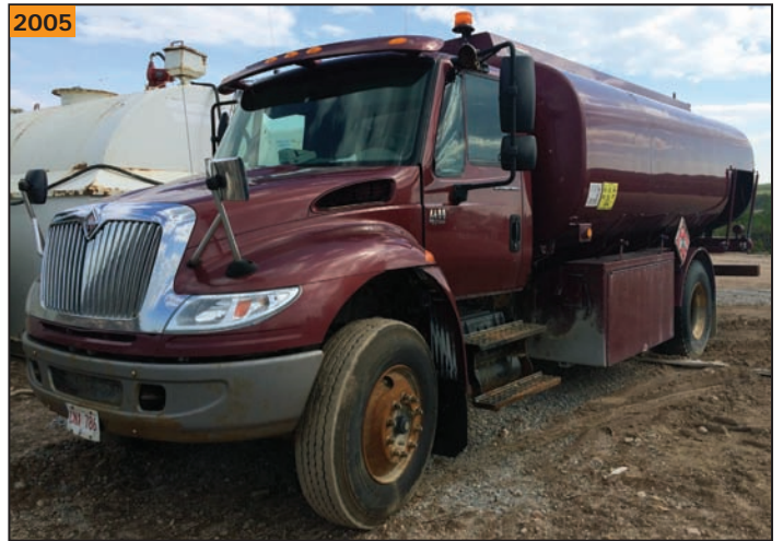
DURASTAR 4400 international fuel truck