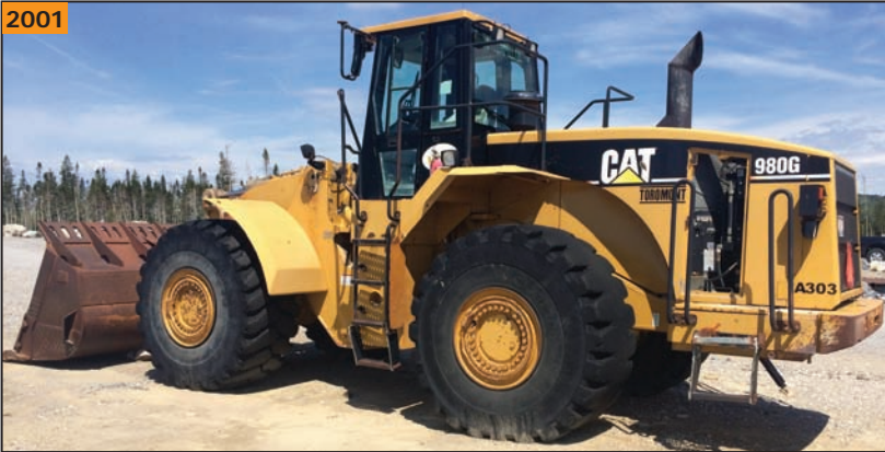
CATERPILLAR 980G wheel loader