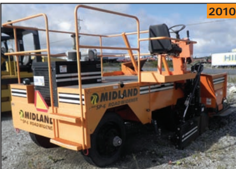
MIDLAND SPR6 road widener