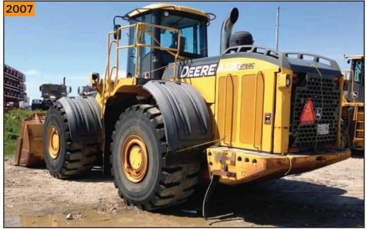
JOHN DEERE 844J articulated wheel loader