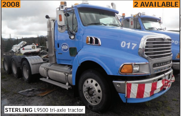
STERLING L9500 tri-axle tractor