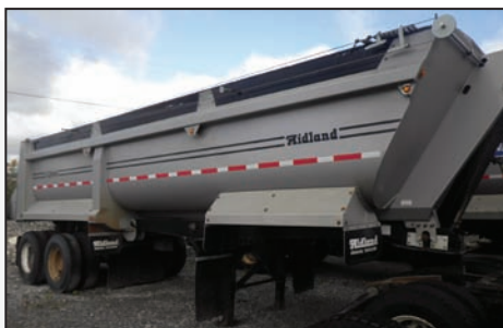
MIDLAND SK2400 tandem axle end dump trailer