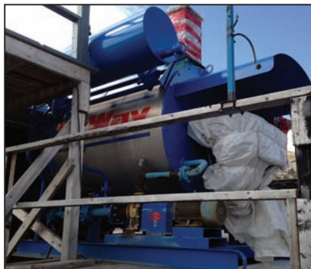
NU-WAY oil fired burner