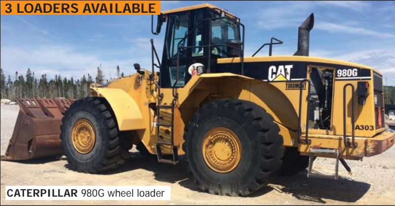
CATERPILLAR 980G wheel loader