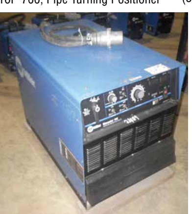
1 of 6 – 2014 Miller Dimension 452 Welders