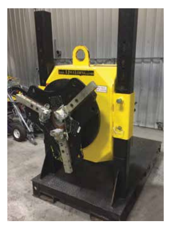
2014 LJ Manufacturing 30P-200, Pipe Turning Positioner