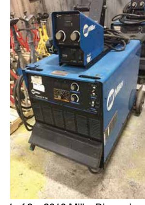
1 of 2 – 2010 Miller Dimension NT-450 Welders