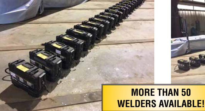
21-2014 Miller Model Suitcase X-Treme 12VS HDD Welders Welders