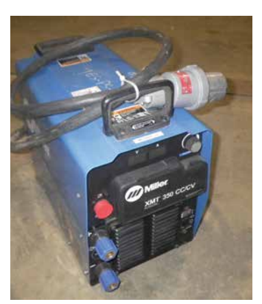
1 OF 18 – 2014 Miller XMT 350 CC/ CV Welders