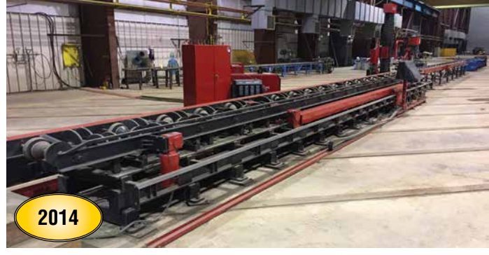
2014 Vernon Tool MPM5-0348, 5 Axis Pipe Profiler