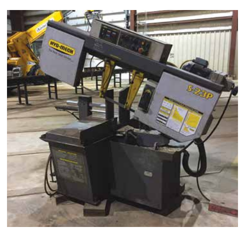
2014 Hyd-Mech S23-P Band Saw