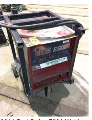
2014 Red-D-Arc E500 Welder