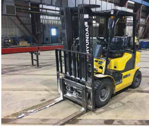
2013 Hyundai Model 25L-7A, LPG Forklift (500 Hours)