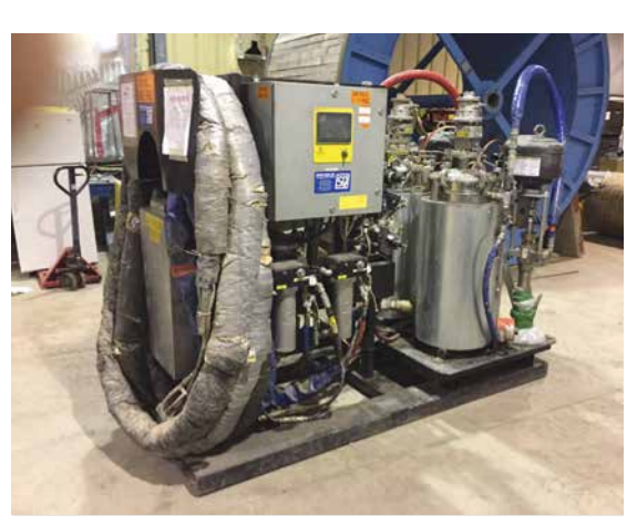
2015 Spray-Quip, Inc. SQ 398-105 Fireproofing Application System