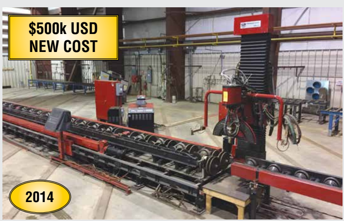
Vernon Tool MPM5 - 0348 Pipe Profiler