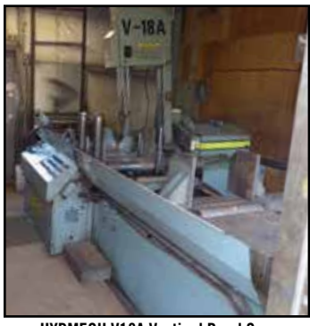
HYDMECH V18A Vertical Band Saw