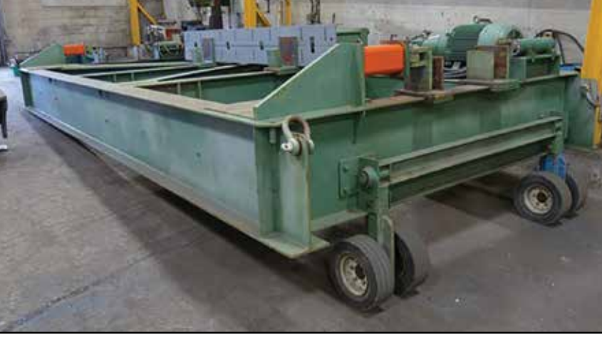
BAY LYNX BC-900 Camber Machine