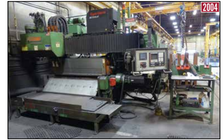
PEDDINGHAUS FDB1500B CNC Plate Processor