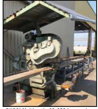
PUCCI Multimatic 20-95S Ironworker