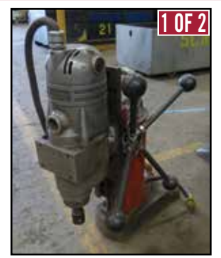
(2) MILWAUKEE Mag Drills