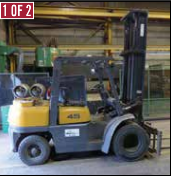
(2) TCM Forklifts

TCM Forklift, Model 45, LP Gas, S/N 10238, 2-Stage Mast, Side Shift, S/N A351000272