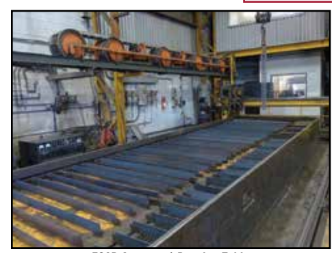
ESAB Avenger 1 Burning Table