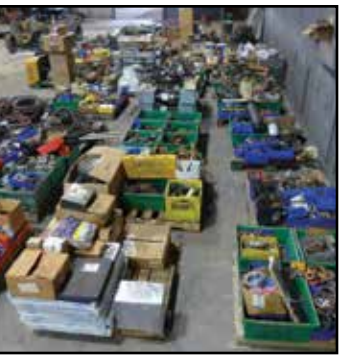
Shop Equipment, Tooling, Tools, Hardware & More