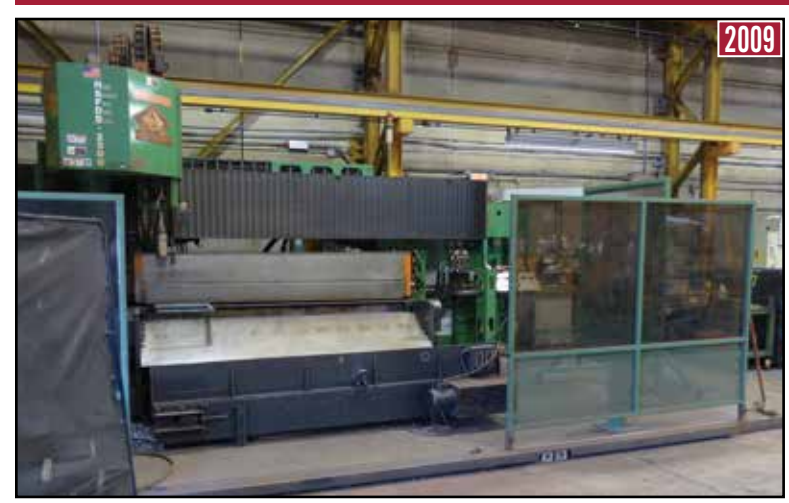
PEDDINGHAUS HSFDB2500 CNC Plate Processor