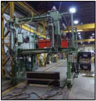
OGDEN DART IV Automated Sub Arc Seam Welder