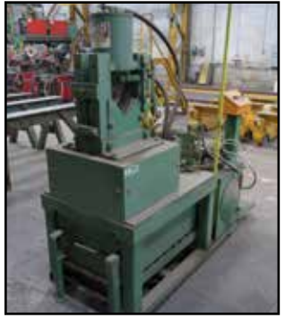
PUCCI Hydraulic Angle Shear