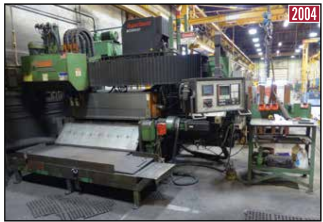
PEDDINGHAUS FDB1500B CNC Plate Processor

PEDDINGHAUS HSFDB2500 CNC Plate Processor