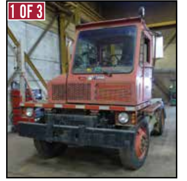
(3) OTTAWA 5039H S/A Spotter Trucks