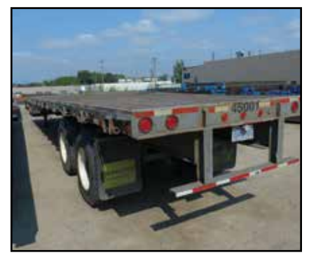
FRUEHAUF T/A Flatbed Stretch Trailer