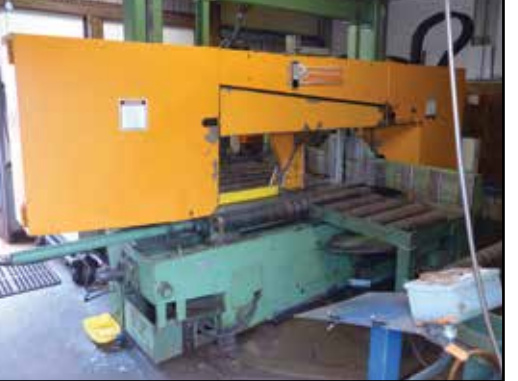
PEDDINGHAUS / GERNETTI 44/19 Horizontal Band Saw w/Infeed / Outfeed Conveyors