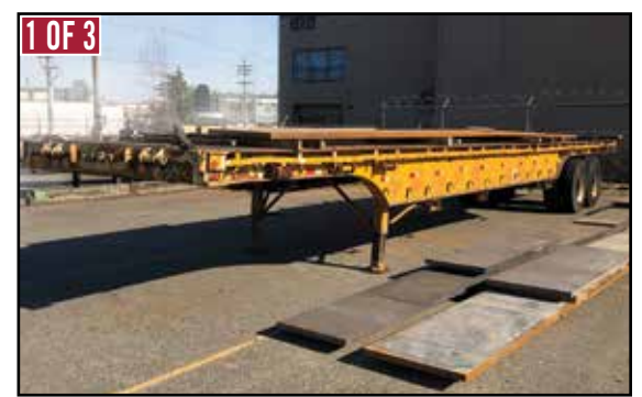
(3) S/A & T/A Flatbed Trailers