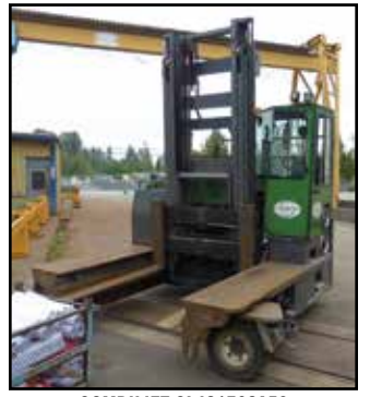
COMBILIFT CL401730A58 17,300-lb. Forklift