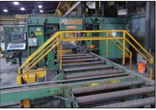
PEDDINGHAUS BDL1250/9A Beam Drill w/27" x 40" Infeed / Outfeed Conveyor

Inspection: Day prior to auction from 9AM-4PM