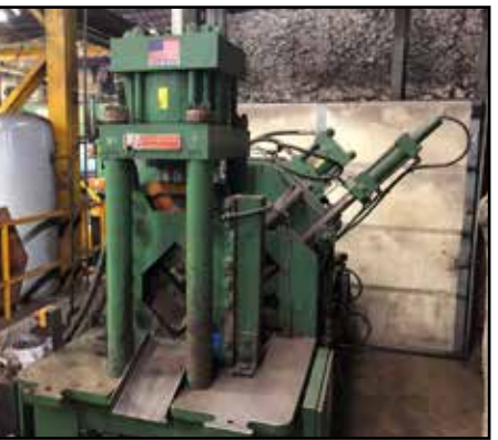
PEDDINGHAUS 6430 Angle Shear