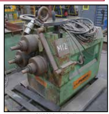
PUCCI Angle Roll