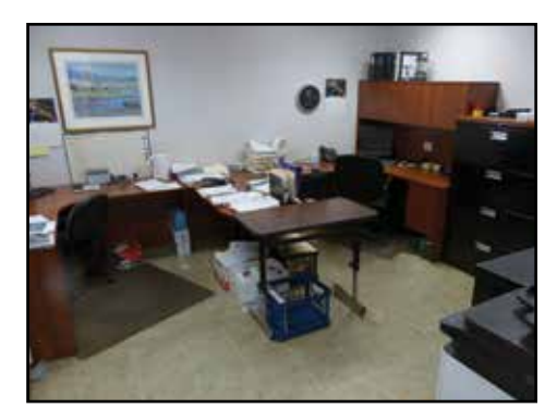
Office Furniture & Equipment