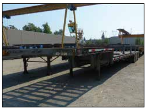
Tri-Axle Drop Deck Trailer