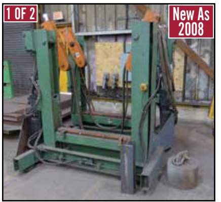
(2) PEDDINGHAUS SWP1200 Beam Positioners