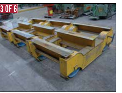
(6) Rail Transfer Carts