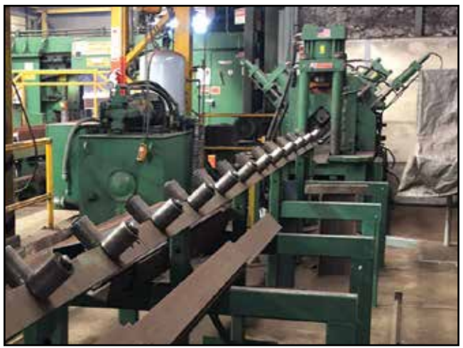
PEDDINGHAUS 6430 Angle Shear