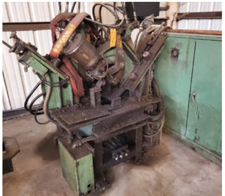
Peddinghaus Angle Master YA3458410