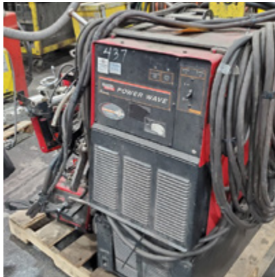
Lincoln Power Wave 1000