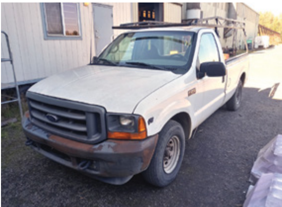
2000 Ford F-250