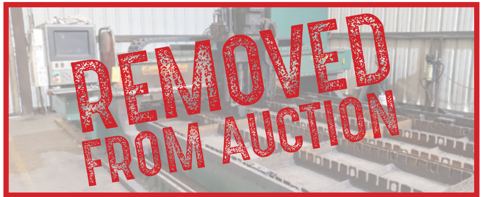
Controlled Automation GPF-1044