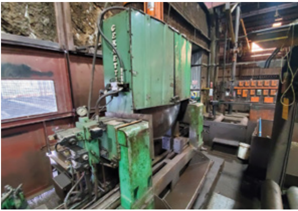
Gernetti SIC 1000 V