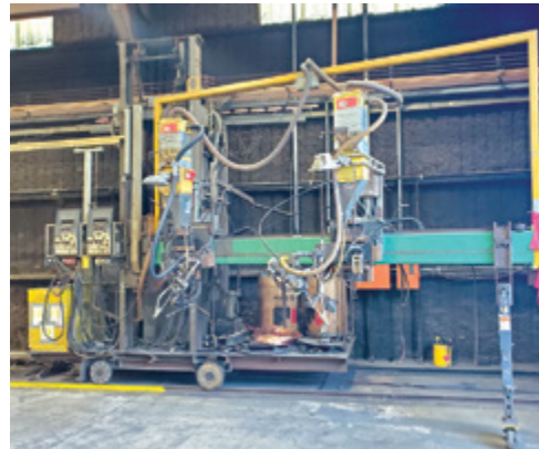
PANDJIRIS Welding Gantry