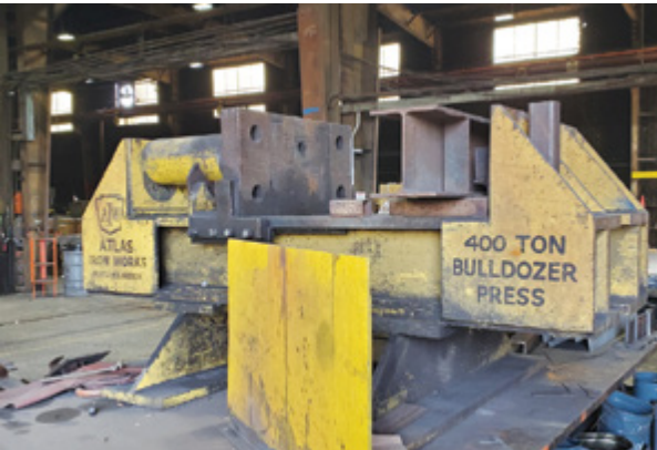
Atlas Iron Works 400 Ton