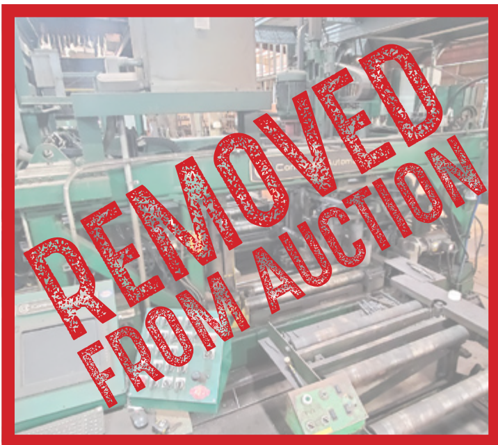
Controlled Automation DRL-344 Beam line

INSPECTION: Friday, November 20, 2020; 9:00 AM to 4:00 PM PT