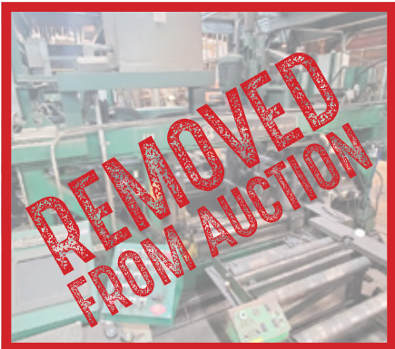
Controlled Automation DRL-344 Beam line