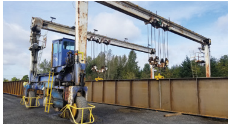
1964 DROTT 650A-1