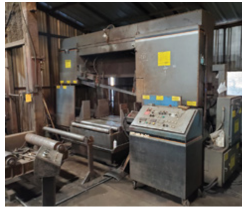
HE & M Saw WF190-LM-DC