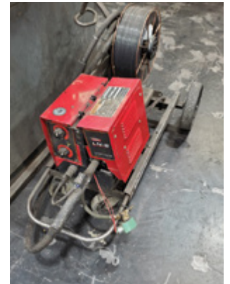
Lincoln LN 8's