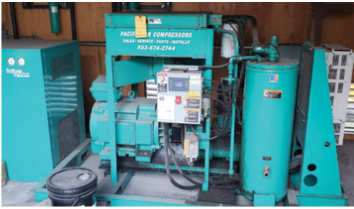
Sullivan Palatek 75UDVWA