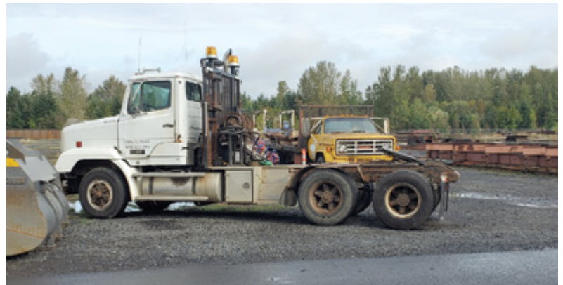
1991 Freightliner T/A