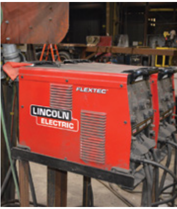
Flextec 500 Welder