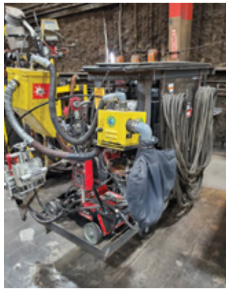
Lincoln Power Wave