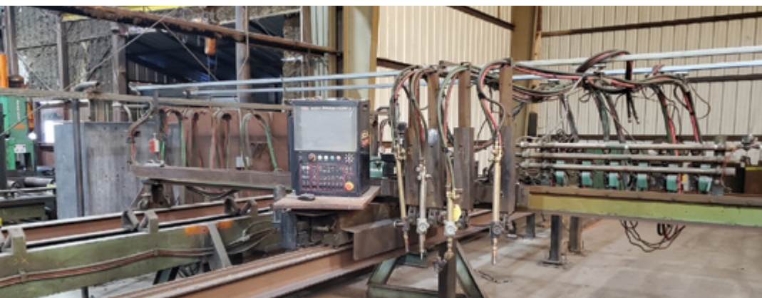
MG Burning Machine PC750 -79-551