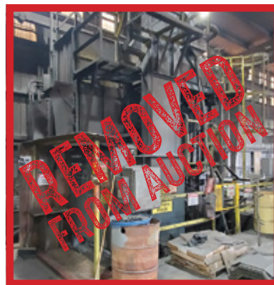
Pangborn Wheelabrator LM-DC